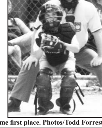
Towns County Lady Indians 10&U Softball team in action at Meeks Park in Blairsville where they took home first place.