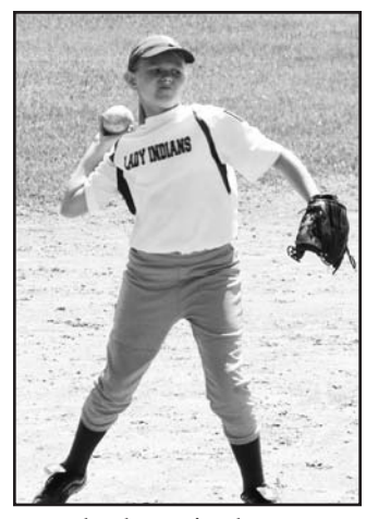
vet to be determined.

Check back with the Towns County Herald next Tuesday for a tournament schedule, so you can make your travel plans to support the Lady Indians as they 26th. Times and opponents are go for a State Championship.