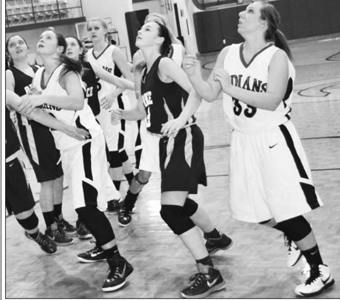
Lady Indians JV in action earlier this year.