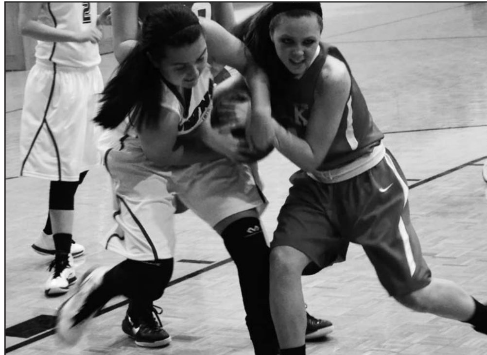
The Lady Indians and the Polk Co. Lady Wild Kittens battle over a loose ball.

The Wild Kittens did make a brief run at the Lady Indians in the second quarter when they included a pair of treys in a 10-2 spurt for a 25-14