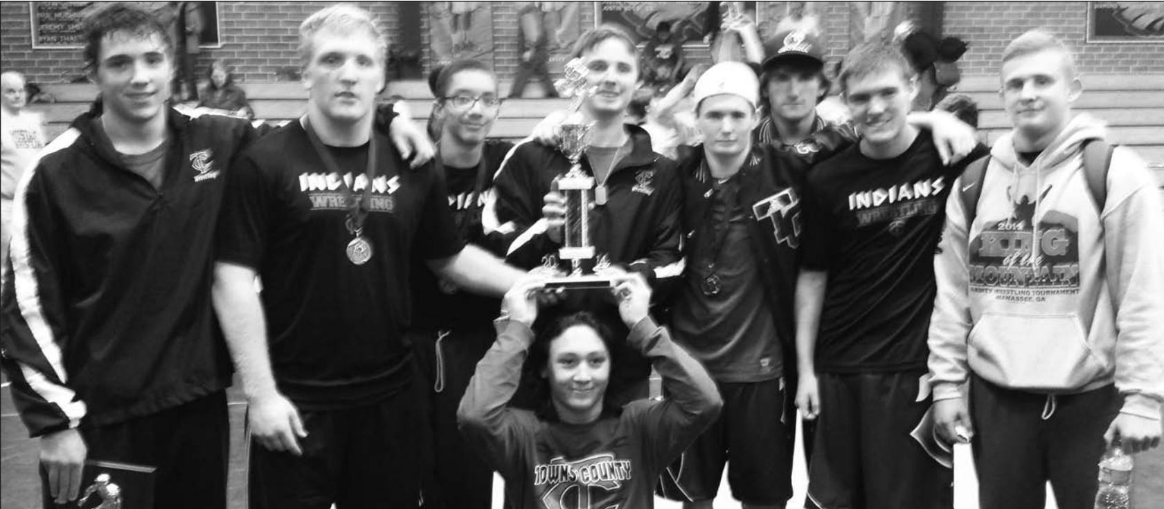
The Towns County Indians wrestling squad after claiming third at Landmark Christian tournament that was held the weekend before Christmas. They will be back in action in Cherokee, NC on Saturday before returning to Georgia for a match at East Jackson in Commerce.