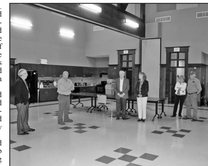
The Grand Tour was available last week at BRMEMC facilities.

The BRMEMC has cut the cost of water purchased from the City of Young Harris by up to 50 percent; a daylight harvesting system using clerestory windows provide natural