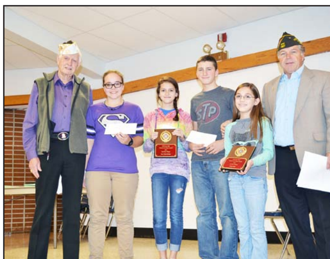
Dec. 18 was a big day for Towns County high school and middle school students as the Voice of Democracy winners were announced.