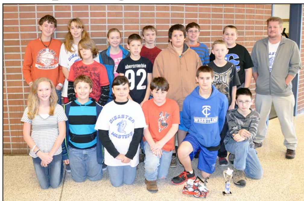
Disaster Masters' Robotics team is headed to the Super Regionals in Athens on Jan. 11th to compete for a chance to go to state.