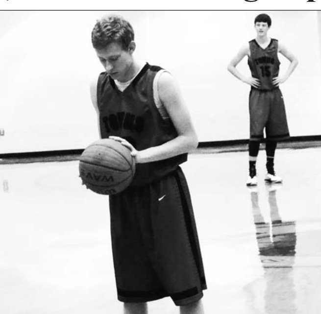
The Lady Indians battle for a loose ball.

The Panthers then sank a seventh trey by the 7:27 mark of the second quarter before cooling down on three point shooting and held a 29-19 lead at 6:31 only to see the Indians rally to within 29-26 on a three point play by Marcus Ledford and two free Scoring leaders for the throws each by Deries and Zach