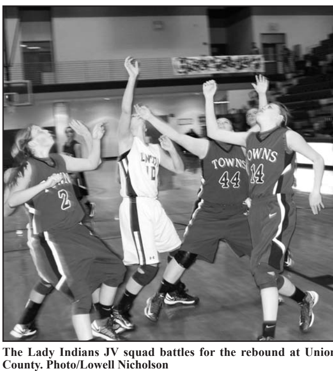
The Lady Indians JV squad battles for the rebound at Union

The Lady Indians had ample opportunities to improve their fortunes at the foul line in the second quarter but managed just 4-for-12 accuracy for the quarter and 5-for-16 for the taking a 57-34 victory.