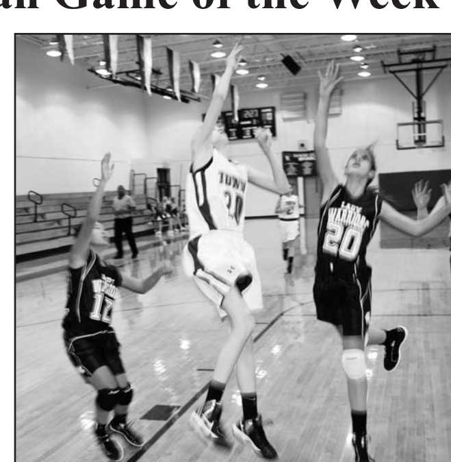
TCMS' girls going for two against White.

"We weren't hitting our shots underneath and that really hurt us. We had trouble moving the ball against their press and the missed oppor- team high eleven points for Indians!