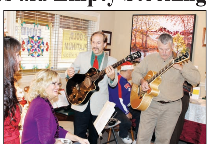
The Gold Academy Empty Stocking Fund toy drive was complete with Classic music from the Rock era.