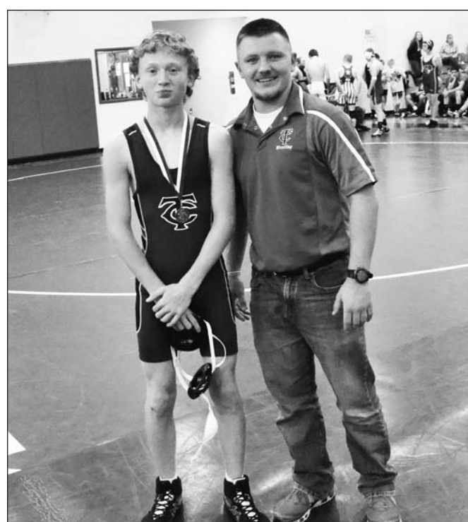
The Middle School King of the Mountain.