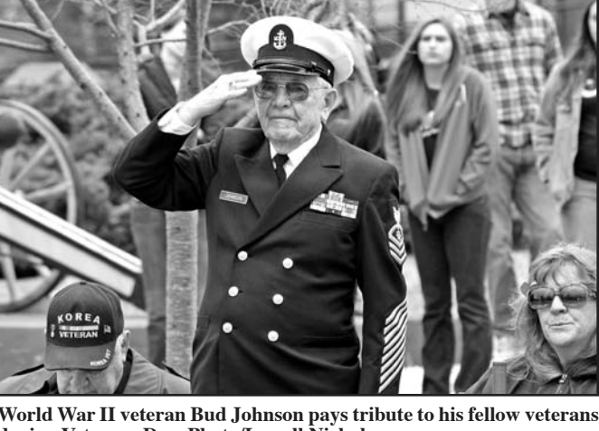
during Veterans Day. of the war – the photo by Alfred anymore, do they? They don't.