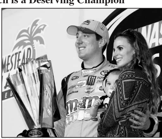
Kyle Busch and family