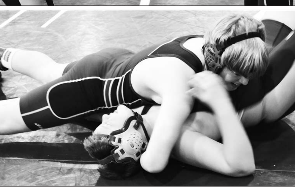
Towns County Middle School King of the Mountain Tournament