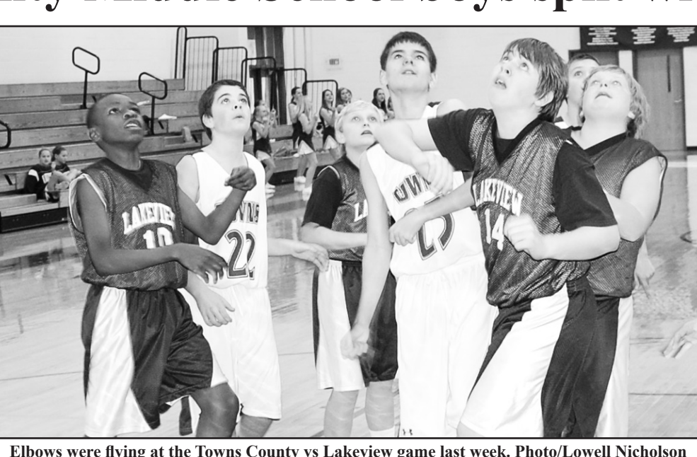
Elbows were flying at the Towns County vs Lakeview game last week.