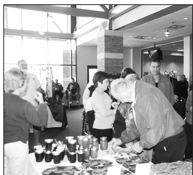
The Christmas Shopping Season is here.

The ever-popular Sugar Plum Tearoom will be back again this year. The homemade goodies, salads, wonderful soups, sandwiches, and desserts are a delight for any palette. After shopping in the