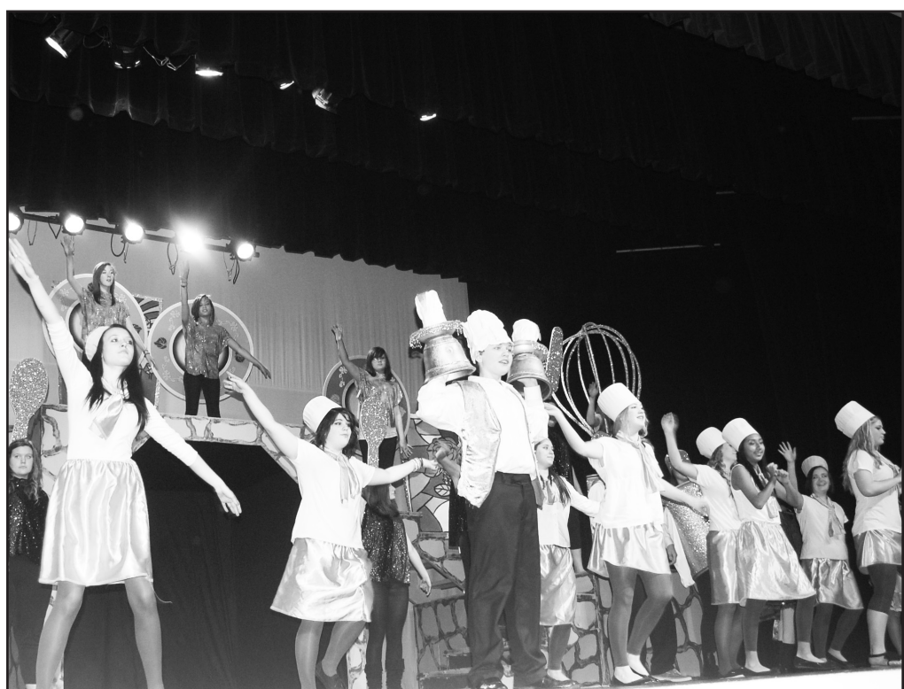
Beauty and The Beast was a masterful performance at Towns County Auditorium.