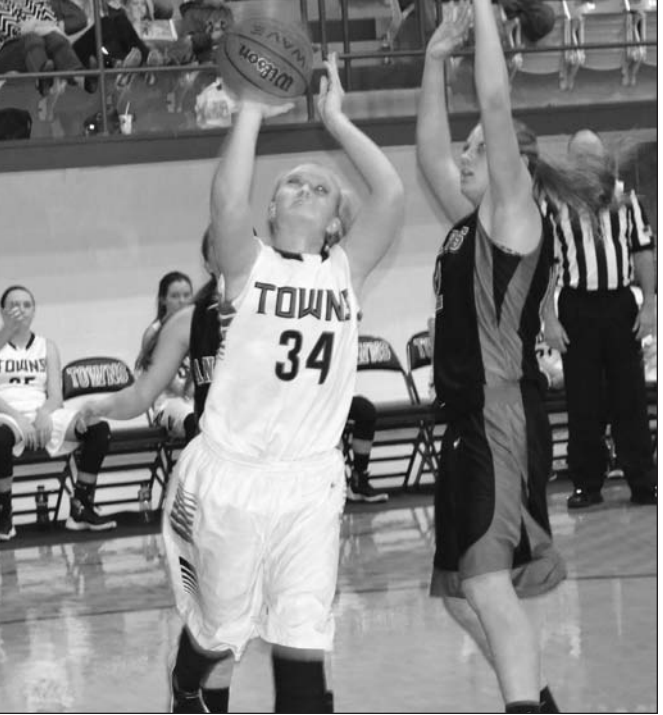
Lady Indians during a scrimmage game with Andrews, NC