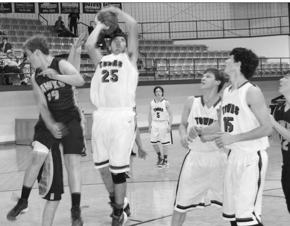
Towns County Indians vs Nantahala basketball