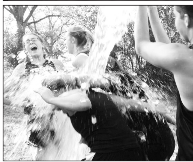
Towns County Cross Country celebrates its State Championship