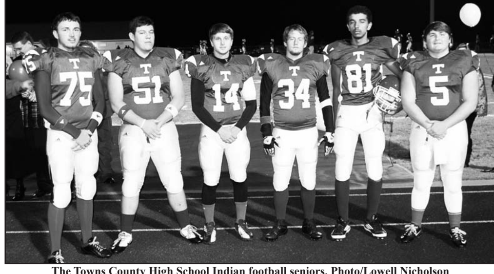
The Towns County High School Indian football seniors.

The offense was fired up as they moved the ball well