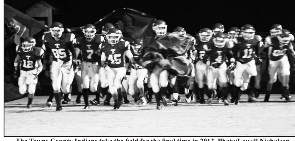
The Towns County Indians take the field for the final time in 2012.