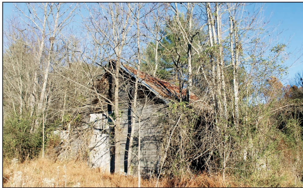
This ancient barn is the center of a local and state investigation following the discovery of human remains in a homemade casket last week in Young Harris.