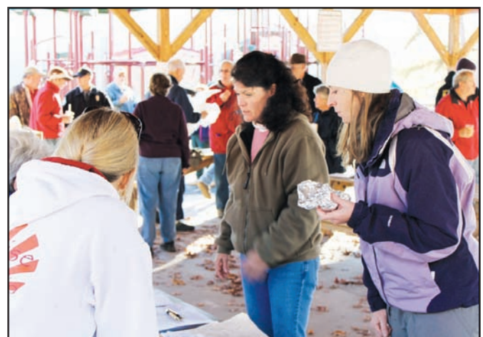
Volunteers were all excited about the Big Sweep along the shoreline of Lake Chatuge on Saturday.