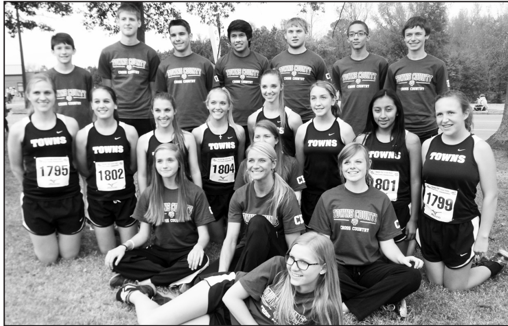
Both Towns County High School Cross Country teams had a strong showing at the Carrollton course. Last year, the Class A race was held in Macon.