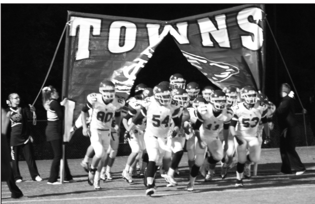
The Indians take the field for the final time in 2013.