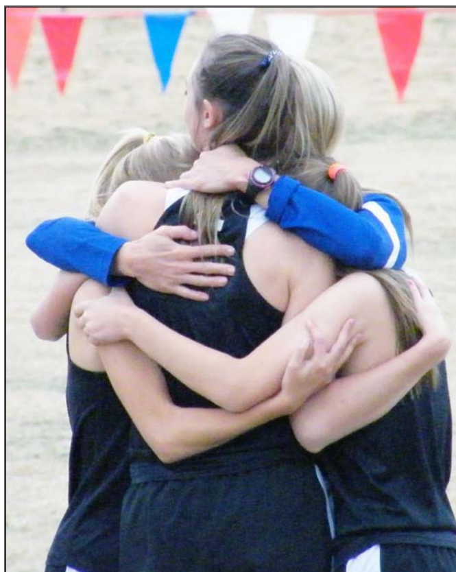
The Towns County Lady Indians celebrate their second straight Class A Cross Country team championship.