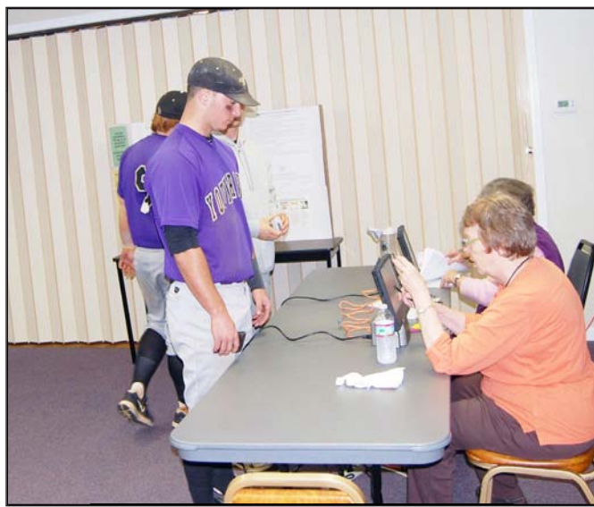
Even the Mountain Lions were casting ballots in the Young Harris City Council race in the Nov. 5th General Election.