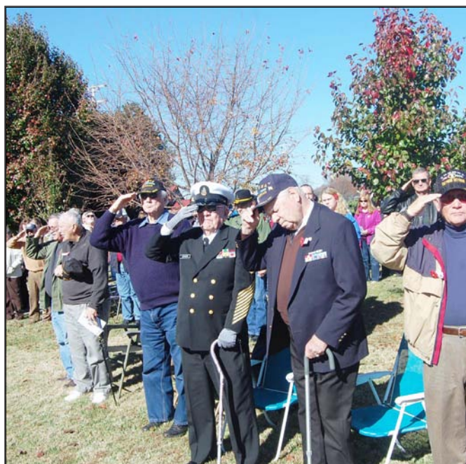
Towns County veterans paid homage to those currently serving, or who have served this great nation.

lain provided the invocation for the service, as well as the introduction for the day's speaker, 9th District U.S. Rep. Doug Collins (R-Georgia); immediately preceding the congressman, the Towns County High School Band played the National Anthem.