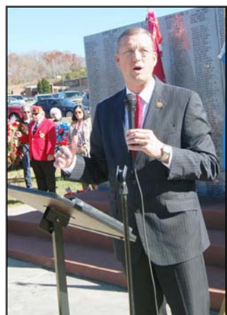
U.S. Rep. Doug Collins

By Azure Welch Towns County Herald Staff Writer