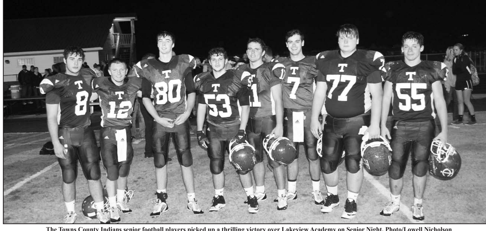
The Towns County Indians senior football players picked up a thrilling victory over Lakeview Academy on Senior Night.