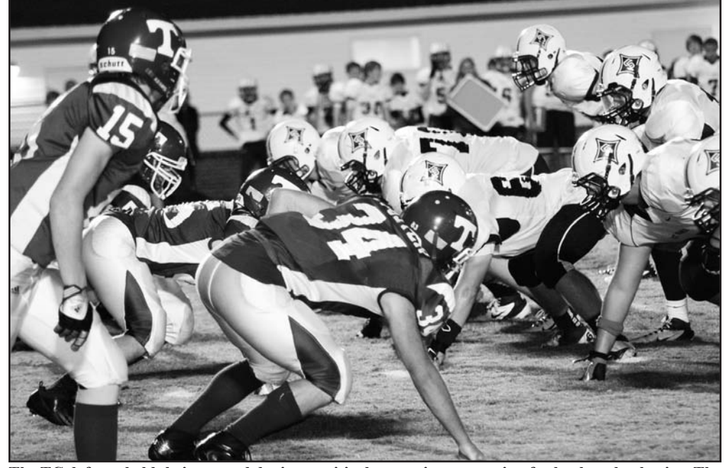
The TC defense held their ground during a critical two-point conversion for back-to-back wins. The Indians go for three straight on Friday for the third time in TCHS history.