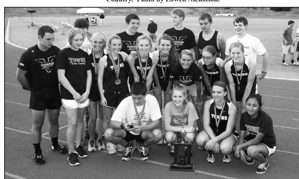
Both teams celebrate their performance at the Area Championships.