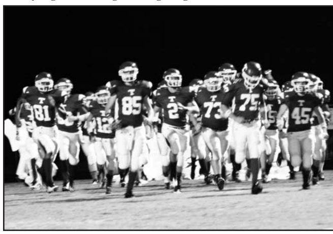
The Indians take the field.