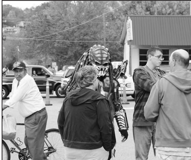
An Alien was among us at Trunk or Treat.

Kids ranging in age from 4 and up were busy kicking off their shoes and climbing into