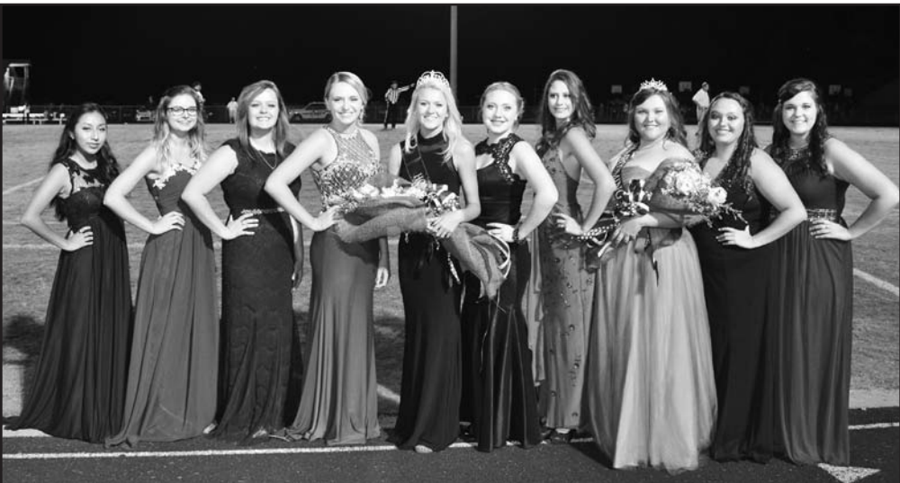
Towns County High School's 2015 Homecoming