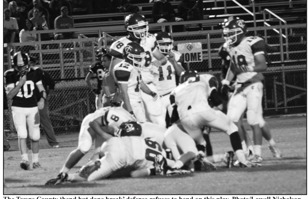
The Towns County 'bend but done break' defense refuses to bend on this play. The Towns County defense will

"We have a big task ahead of us next week, really the next three games are," Coach Har-rison said. "But it feels good to get a couple of wins in a row. It shows that all the hard work is starting to pay off, but we've remaining on the schedule.