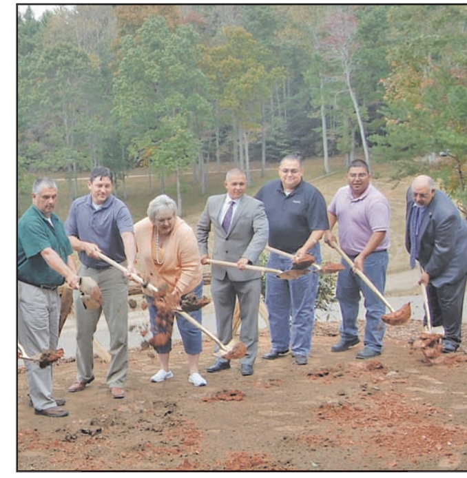
A new casino in Murphy, NC could mean 900 new jobs for the region. and $39 million in new money into local economies. Hundreds of construction jobs also will be created.

by the Eastern Band of Cherokee Indians and will be managed by Caesars Entertainment