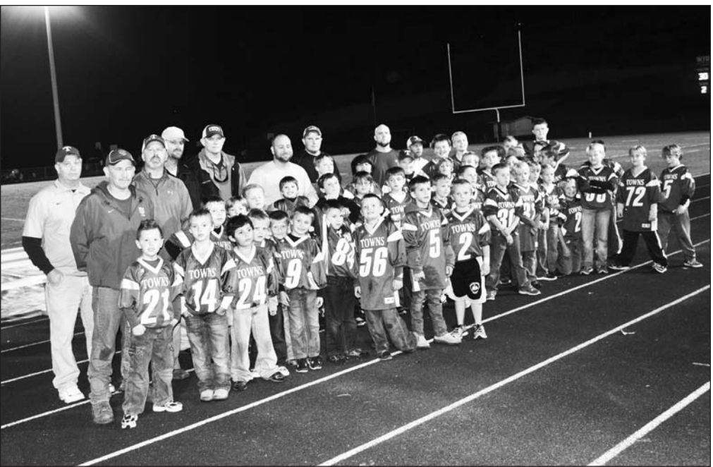
The future of Towns County Indians football at halftime of the varsity game.

The Towns County Indians face Commerce in their next to last game of the year on Friday at 8 p.m. on the Tigers' home turf.