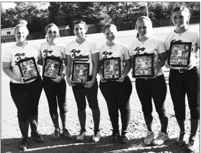
The six seniors on this year's Towns County Lady Indians softball team have laid a solid foundation for the program to build on in the coming years.