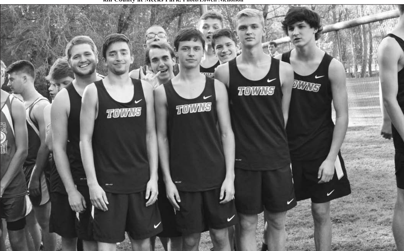
The Towns County Indians cross country team awaits the starting gun at Meeks Park last week.