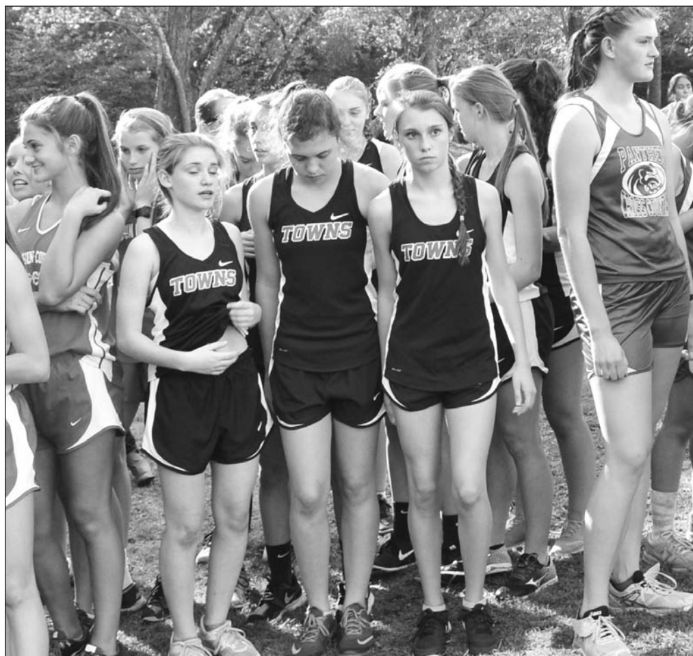
The Towns County Lady Indians cross country team defeated Hayesville, NC, Murphy, NC, and Lumpkin County at Meeks Park.

The boys and girls teams traveled to Tallulah Falls on Tuesday, Oct. 20, for their last regular season meet before the upcoming Area 4 Public School Championship.