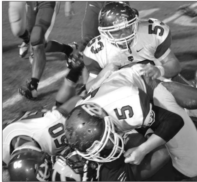
The Indians defense swarms a Prince ball carrier.

The next 13 minutes were all Towns County's, as the Indians ate up the clock driving the ball from their own 13-yard line in for a score. In 17 plays, the Indians came up with six first downs and another score off a quarterback