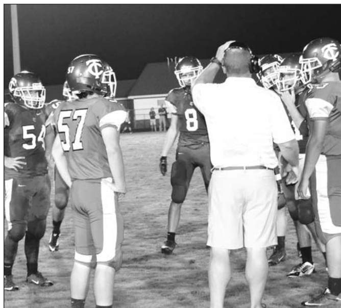
The Indians talk things over during a timeout.