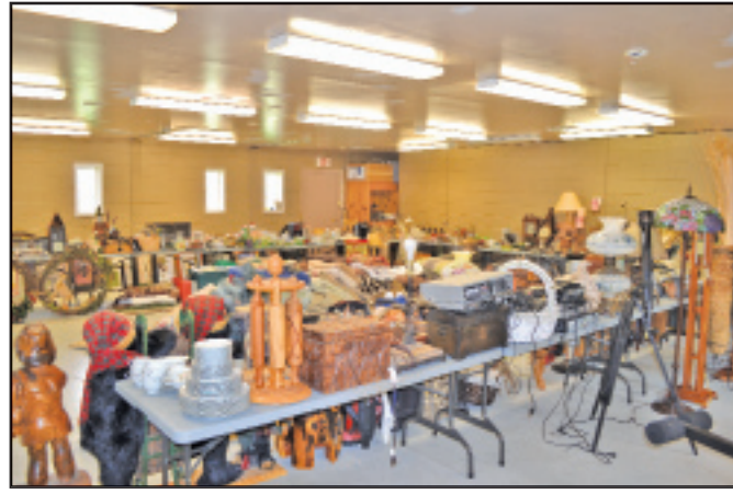
Suspected stolen property

By press time Monday, investigators were still looking into the belief that the suspected stolen property could have been taken from several surrounding counties, including Towns County, and the investigation is ongoing, with additional arrests and charges likely to follow, according to the Towns County Sheriff's Office.