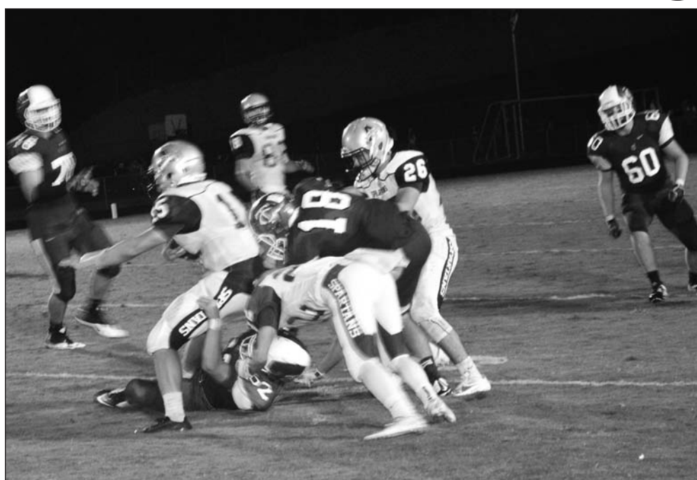
things up in the second half against Athens Academy.