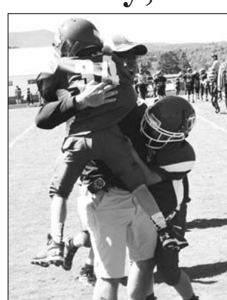
set against Franklin in two weeks.