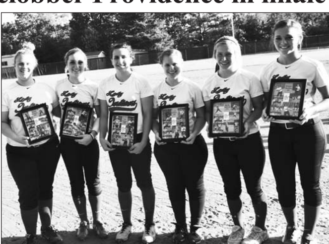
Towns County says farewell to its seniors.