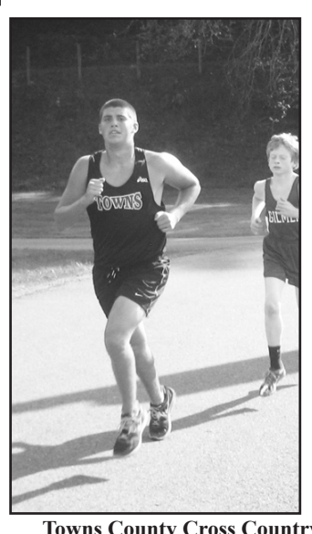
Towns County Cross Country in action at Fannin County.

Good luck Indian runners and keep up the hard work because it is paying off.