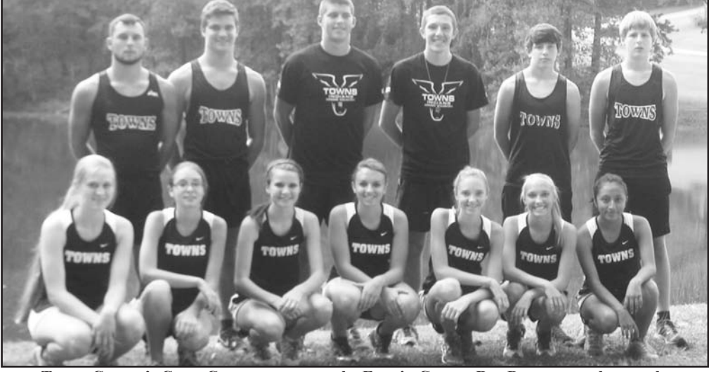
Towns County's Cross Country teams at the Fannin County Rec Department last week

better so keep practicing. Good luck and I will see you on the course!