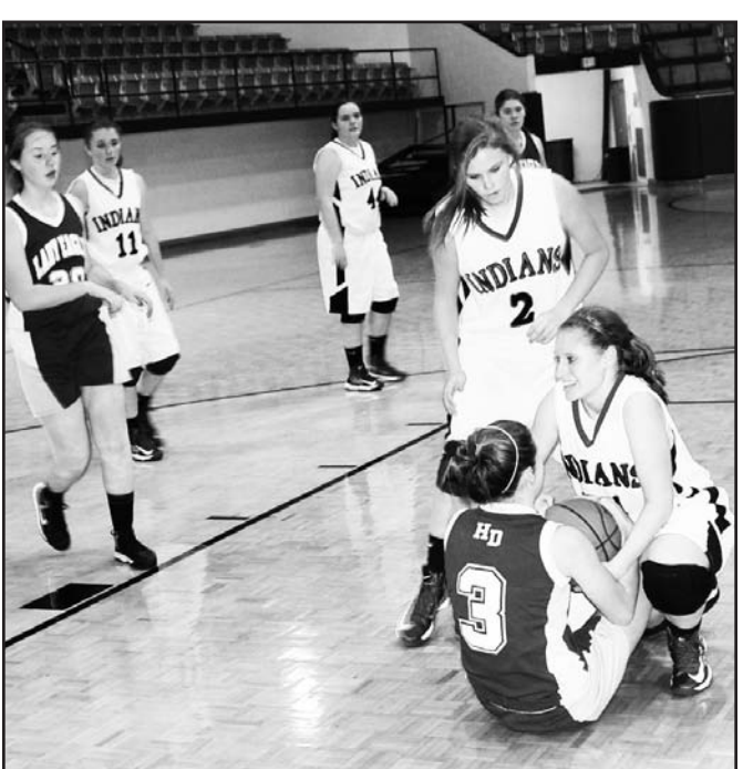
The Towns County Lady Indians' JV team in action during a recent game.