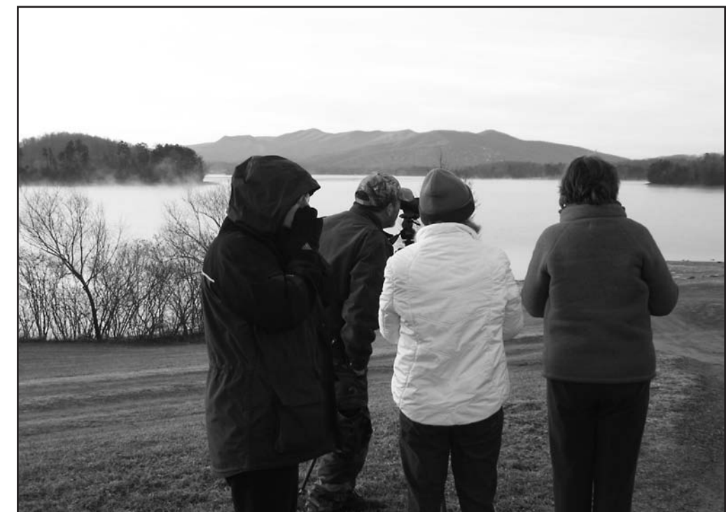
If you're going birdwatching, remember, bundle up. It's cold this time of year.