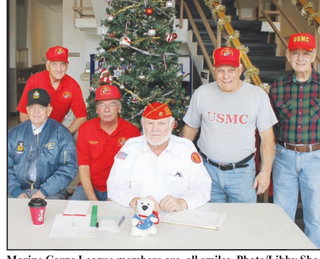
Marine Corps League members are all smiles.