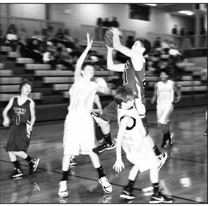
TCMS during its win over Lumpkin.

the wood for the second game of the night against the distinct height and size advantage of the amazing 12 assists. McClure LCMS Indians but they were not intimidated in the least. They fought for position under the boards and got the fast break going early which led to a halftime lead of 28-15.