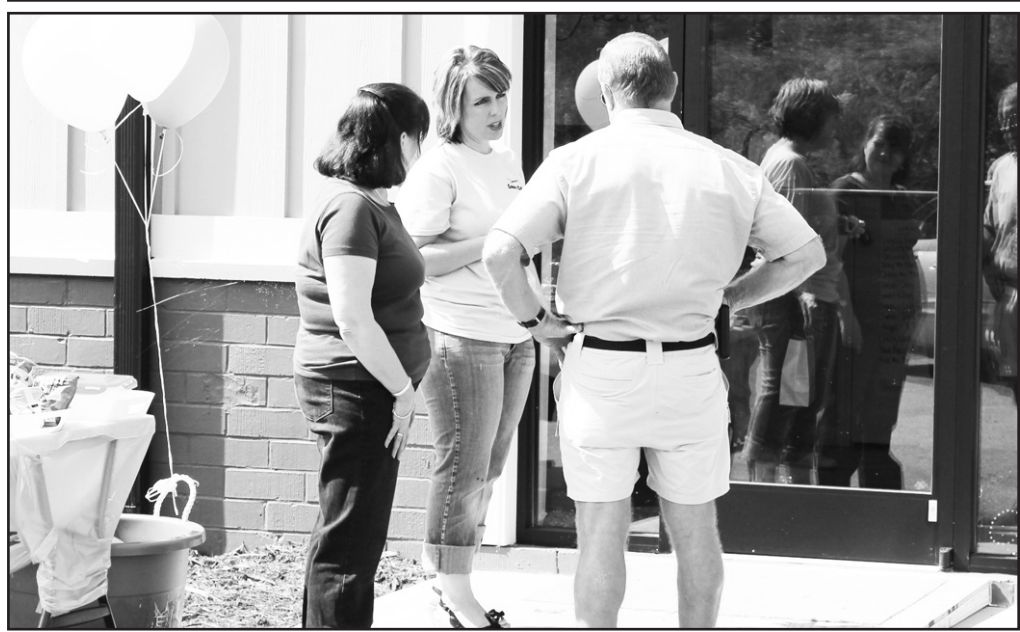
Inside, customers enjoy registering for door prizes; outside, the cherish a free hot dog. The first day of fall worked like magic for Country Cut Away.

She has been a customer for more than a year.