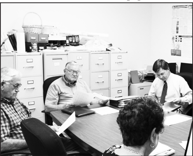
Water Authority members go over the 10-year plan for the future last week in Hiwassee.

this month. That's very hopeful; the average would be 10-12 per month."