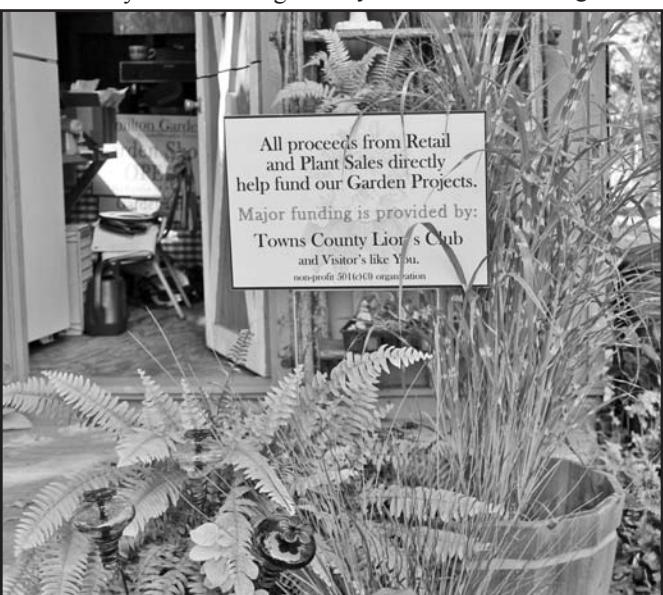
The sign at Hamilton Gardens says it all. The annual fundraiser is underway.

The Hansens encourage everyone to come out and help support the Hamilton Gardens this fall by purchasing a garden gift card or a native perennial from the Garden Shop or just come by for a stroll in the gardens.