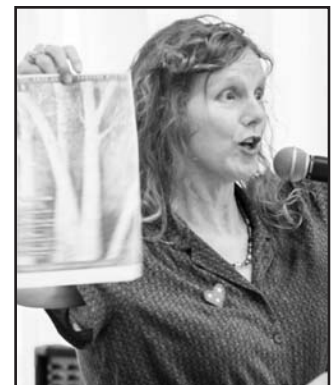
Fall Landscape Colors by Juli Sibley as you hone your powers of observation! This class is for beginners through advanced and all those with a love of nature. Bring: 9x12 (or similar) sketchbook, colored pencil set, (any brand) regular pencil, sharpener, or conte crayons.

Enjoy the beautiful colors of Fall on a mountain campus