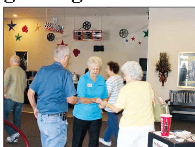
Folks have been lining up to see Trouble with the Curve , which was filmed in Georgia, including in Young Harris and Towns County.