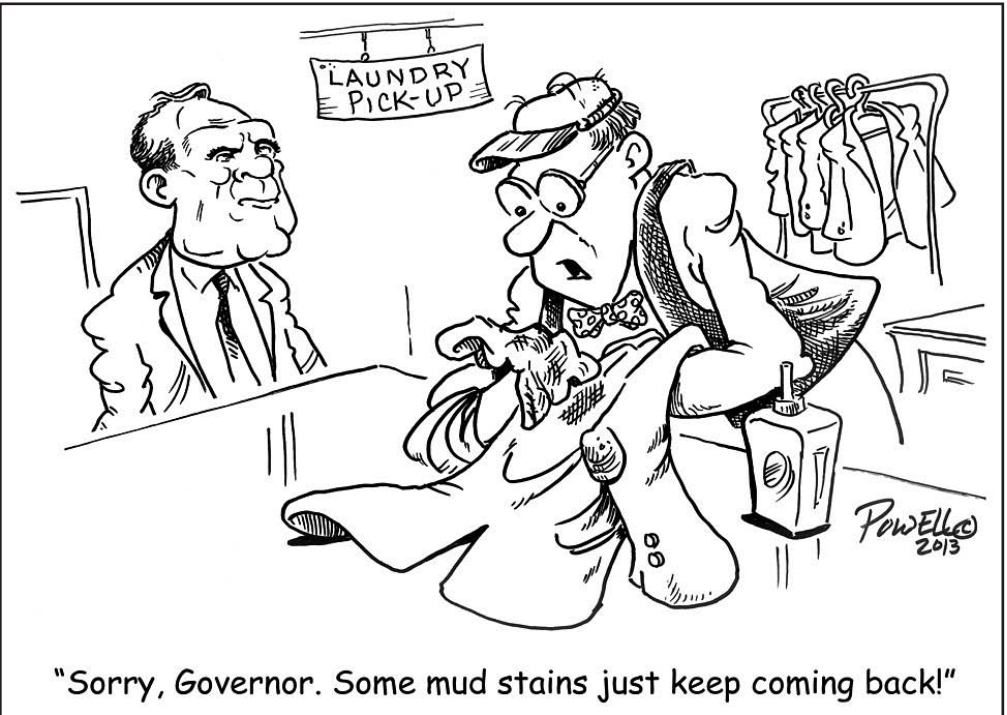
"Sorry, Governor. Some mud stains just keep coming back!"