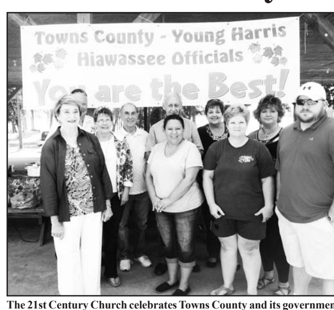
The 21st Century Church celebrates Towns County and its government leaders.