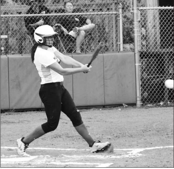
Towns pounded out 17 runs during the first two wins of its three game win streak.

With 17 hits, it's no wonder the Lady Indians won by such a large margin. Let's hope their bats stay hot for the remainder of the season.