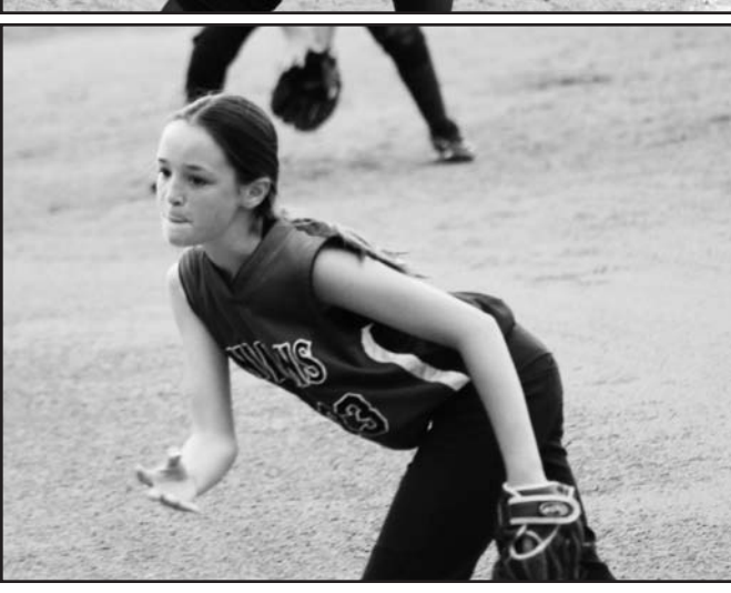
TCMS faces off with Lumpkin County.