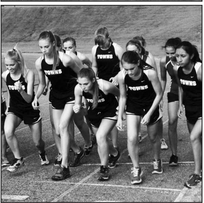
Towns County Indians and Lady Indians Cross Country at Banks County last week.