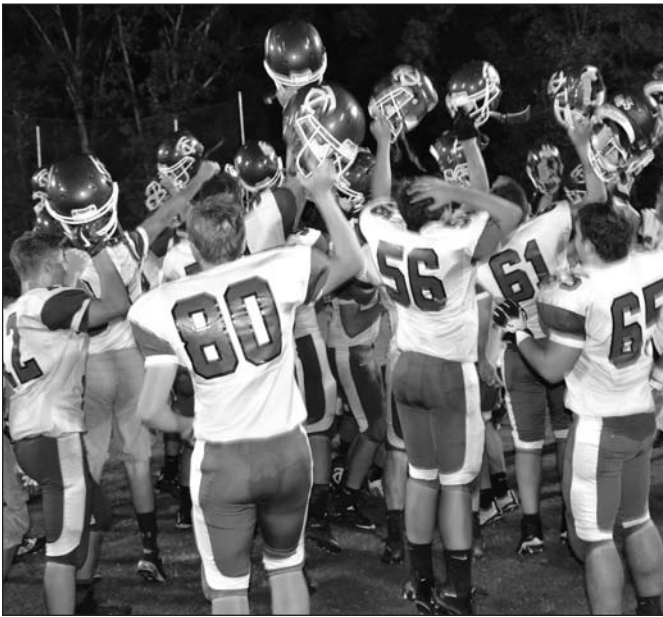
The Indians celebrate their first win of 2015.

During Lakeview's first possession of the second half, Towns County sophomore Andy Chambers caught an interception in Indians territory, starting a 14-play series that went all the