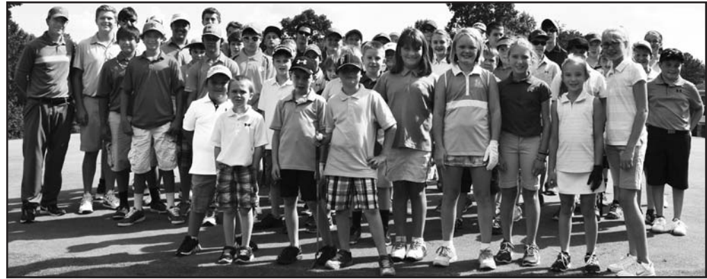
Members of the Tri-County Junior Golf Association

The Tri-County Junior Golf Association is proud to once again be holding the "Jacky Jones Fall Tour." The Tour is a series of 5 junior golf tournaments held throughout western North Carolina and Northeast Georgia. This is the 13th year of the Fall Tour.