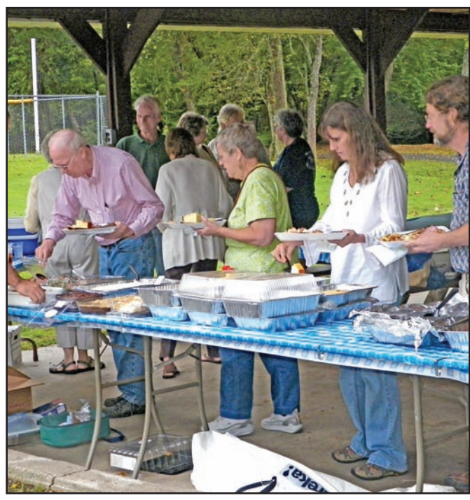
Those attending the Hiawassee River Watershed Coalition's annual trout dinner weren't disappointed.

For more than 10 years the HRWC has provided water quality education and funding for and implementation of volunteer watershed restoration projects.