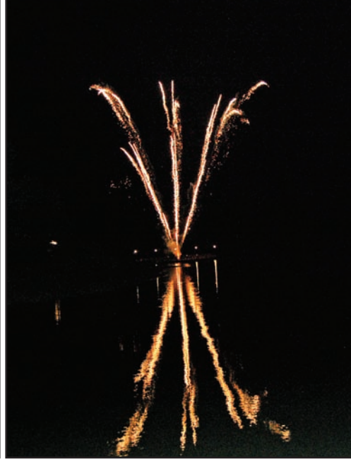
Left, members of the Harley Owners Group catch a look at another member's bike; right, a rocking fireworks display at the Ridges Marina & Resort on Lake Chatuge.

they appreciated them coming back to Hiawassee for 2012.