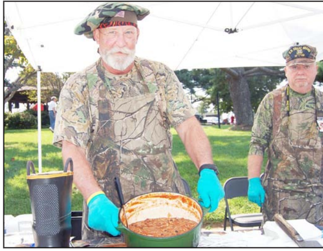
Pigtorkin Boys Chili returned with tasteful bliss on Saturday to Towns County Fire & Rescue's Chili Cook-off. The boys took first place and pocketed $300.