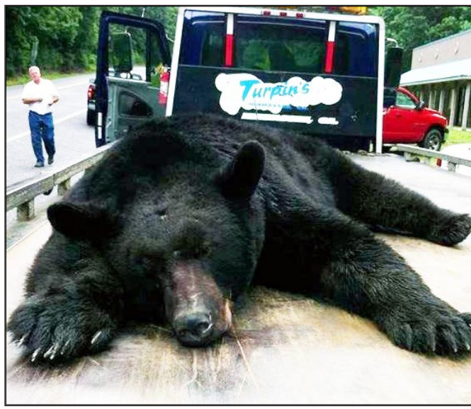
This black bear has eaten his last ear of sweet corn in Towns County.

While no official measurements were taken, the bear was estimated to be roughly