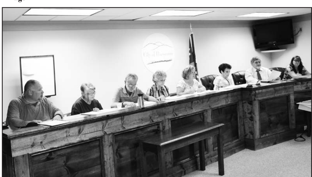
The Hiawassee City Council listens to discussion about Parcel 52, the future Mayor's Park during last week's Council meeting at City Hall.