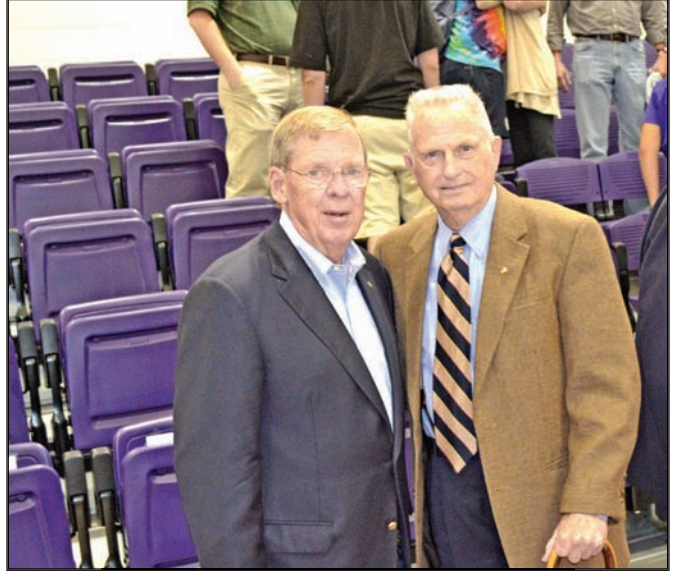
U.S. Sen. Johnny Isakson and former Georgia Governor and retired U.S. Sen. Zell Miller reminiscence at Young Harris College last week.

Students of Young Harris College asked the first round of