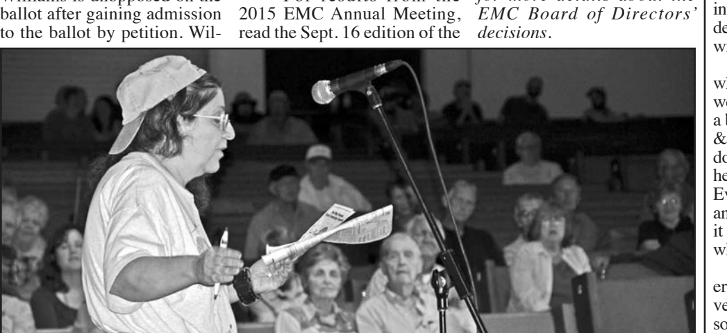
The BRMEMC membership was extremely vocal in 2014.