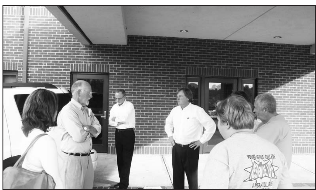
City of Young Harris LOST negotiators outside the Towns County Senior Center.

At the joint meeting on Aug. 23rd, Hiawassee and Young Harris unveiled their presentations based on the