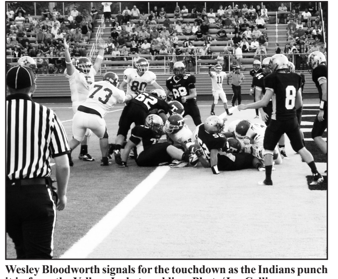
it in from the Yellow Jacket goal line.

Hayesville took the following kickoff on their 25yard line and returned it to mid-field where a Jackets'