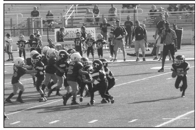
Towns County Youth Football League

"We're just going to returning players. get better," he said confidentially. "We've got a lot the minority; most of the of good looking kids out. It's going to get better for us. We